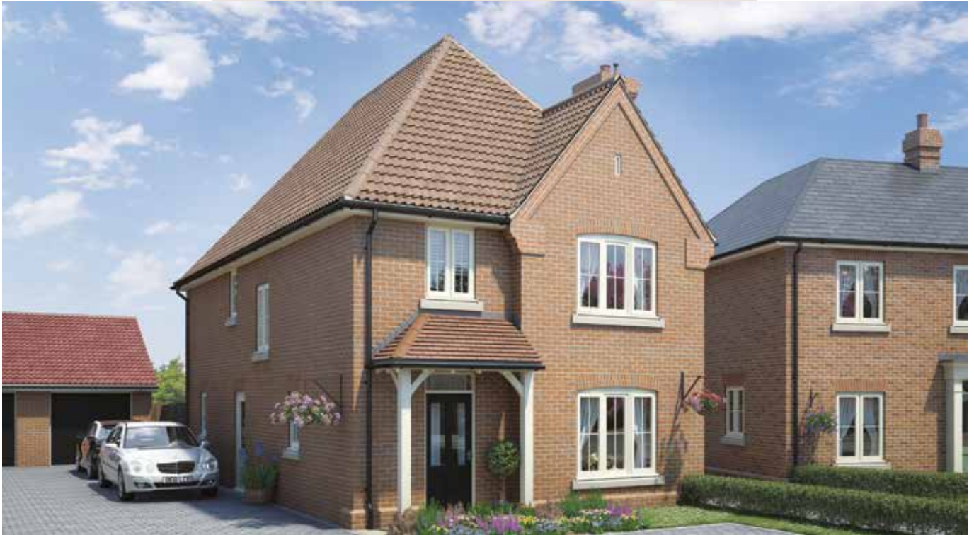
A traditional style, 4 bedroom detached house with garage