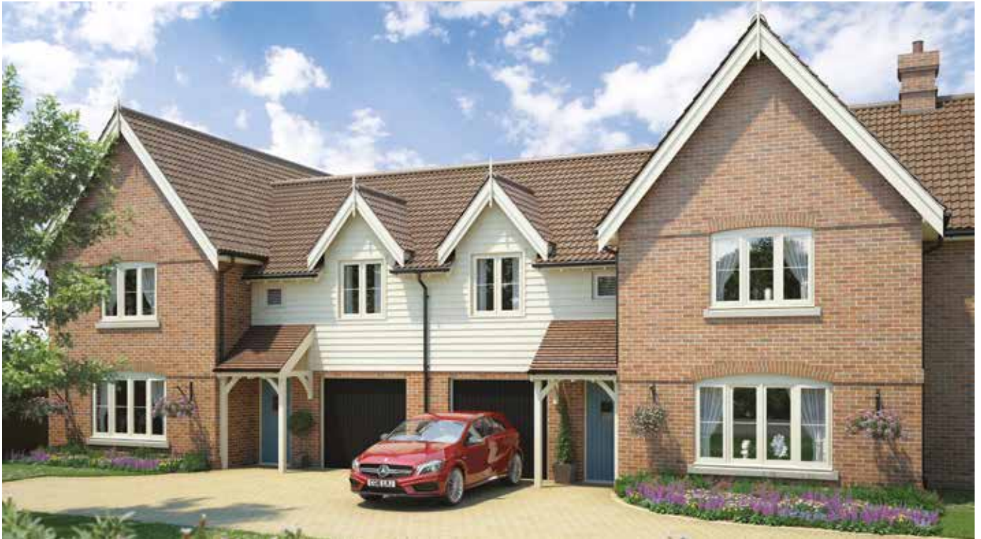
A cottage-style 4 bedroom terraced house with carport